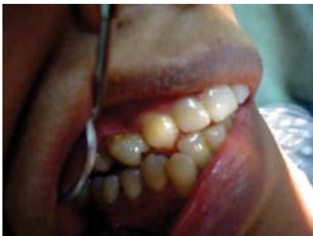
Fig. 6 Extreme excursion shows how 14 is doomed because it's playing for long the role of canine, which was supposed to do this dirty work. That's why canine was designed the longest; most curved and placed at the most curved part of the arch. This arrangement continues to push or place 44 lingually.