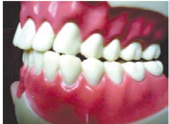
Fig. 4 If you have Canines with lost tips or misplaced Canines that is if they don't tip against each other during lateral excursion, due to wear of tip or palatal surface, along with other factors listed on left - You brux.