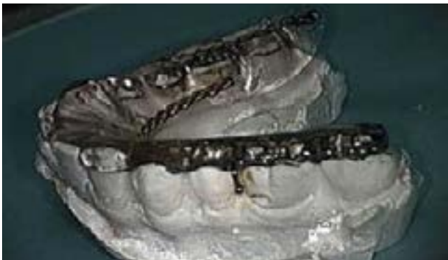
Fig. 2 Various types of unnecessary guards exist.