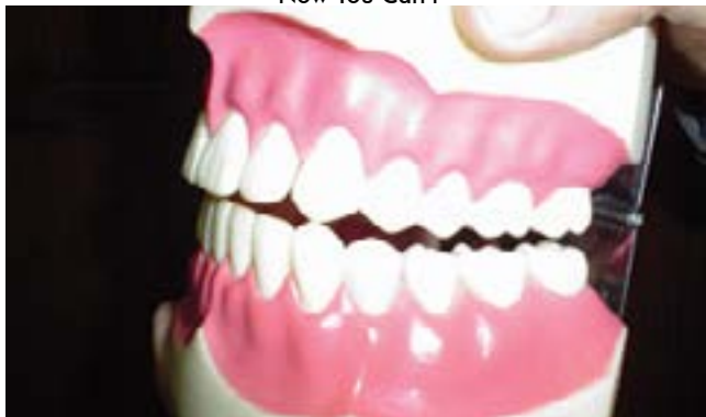
Fig. 3 If you have this relation both anteriorly and laterally, essentially laterally with zero overjet throughout the 3mm overbite recommended.