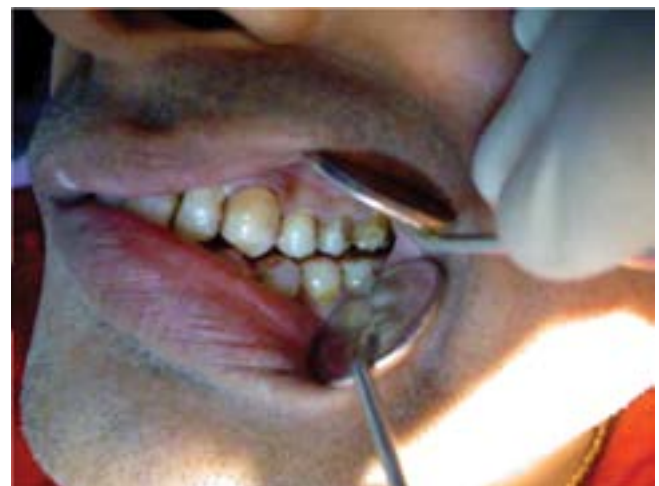
Fig. 9 Esthetics was compromised to slightly build the slopes mentioned above to provide required guidance in this Bruxer.