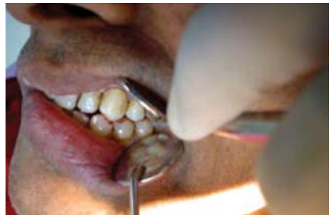
Fig. 8 Canine Guidance under correction. The lower canine distal slope meets the upper canine mesial slope during excursion. In spite of adjustment not enough guidance.