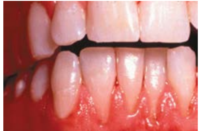
Fig. 7 Anterior and lateral grinding both possible, as there is no stop for grinding. Hence Dr. Sanjay Arora recommends Zero Overjet of the type of "Zero" called "Arora's Zero Overjet"- where entire 3mm of proposed "Arora's Overbite" is having Zero gap between the Upper and Lower Anteriors, with Pressures as recommended by "Arora's Anterior Guidance" Principles, which requires a T-scan, BioEMG and Biojva combine only.